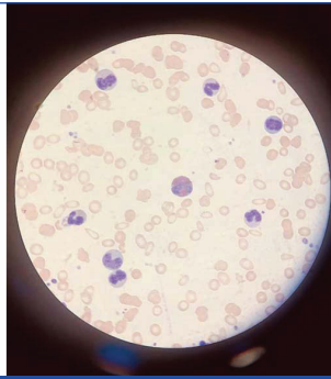
[Table/Fig-5]: HRCT thorax showing traction bronchiectasis. [Table/Fig-6]: Showing follow-up image with reduced eosinophilia (Geimsa stain, 400X magnification). (Images from left to right)